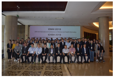
ICHSM 2019 Xiamen, China