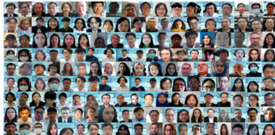
ICHSM 2022 Virtual Conference