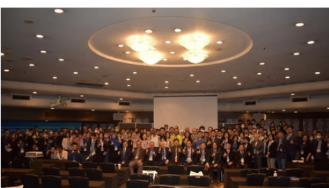
ICHSM 2023 Kyoto, Japan