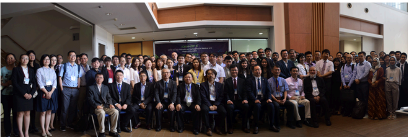
ICHSM 2018 Tsukuba, Japan