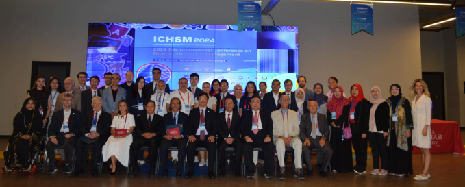
ICHSM 2024 İstanbul, Turkey