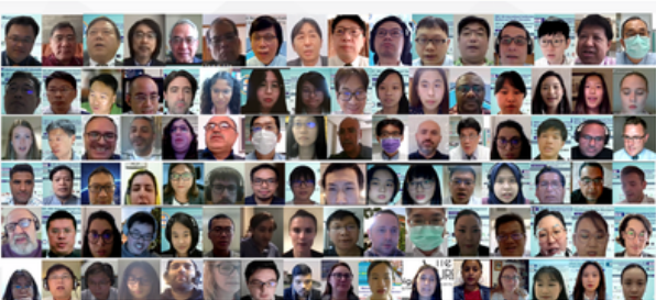
ICHSM 2021 Virtual Conference